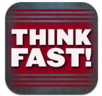
Think Fast About the Past