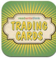
Read Write Think Trading Cards