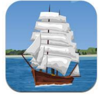
European Exploration: The Age of Discovery