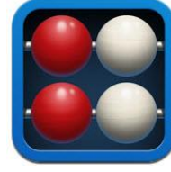
Number Rack for iOS