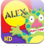
Moody Monster Manor