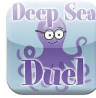
Deep Sea Duel