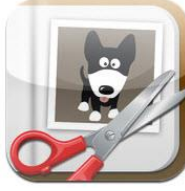
Little Story Maker