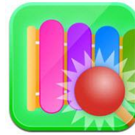
Xylophone from Interactive Alphabet