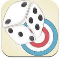
5 Dice app